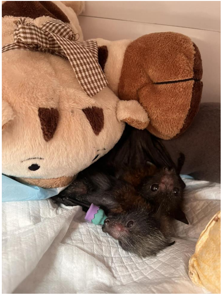
Bat Creche (life after I.C.U)