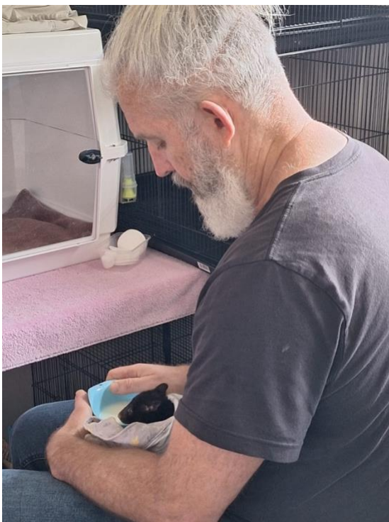
Life after the I.C.U.