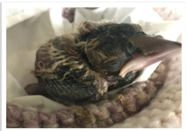
How beautiful is nature. Two days later they're safely released