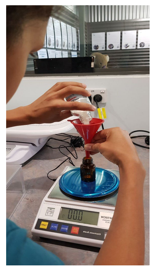
Figure 3- Weighing 1 gram of antibiotics.

We look forward to continuing to our new equipment into the future.