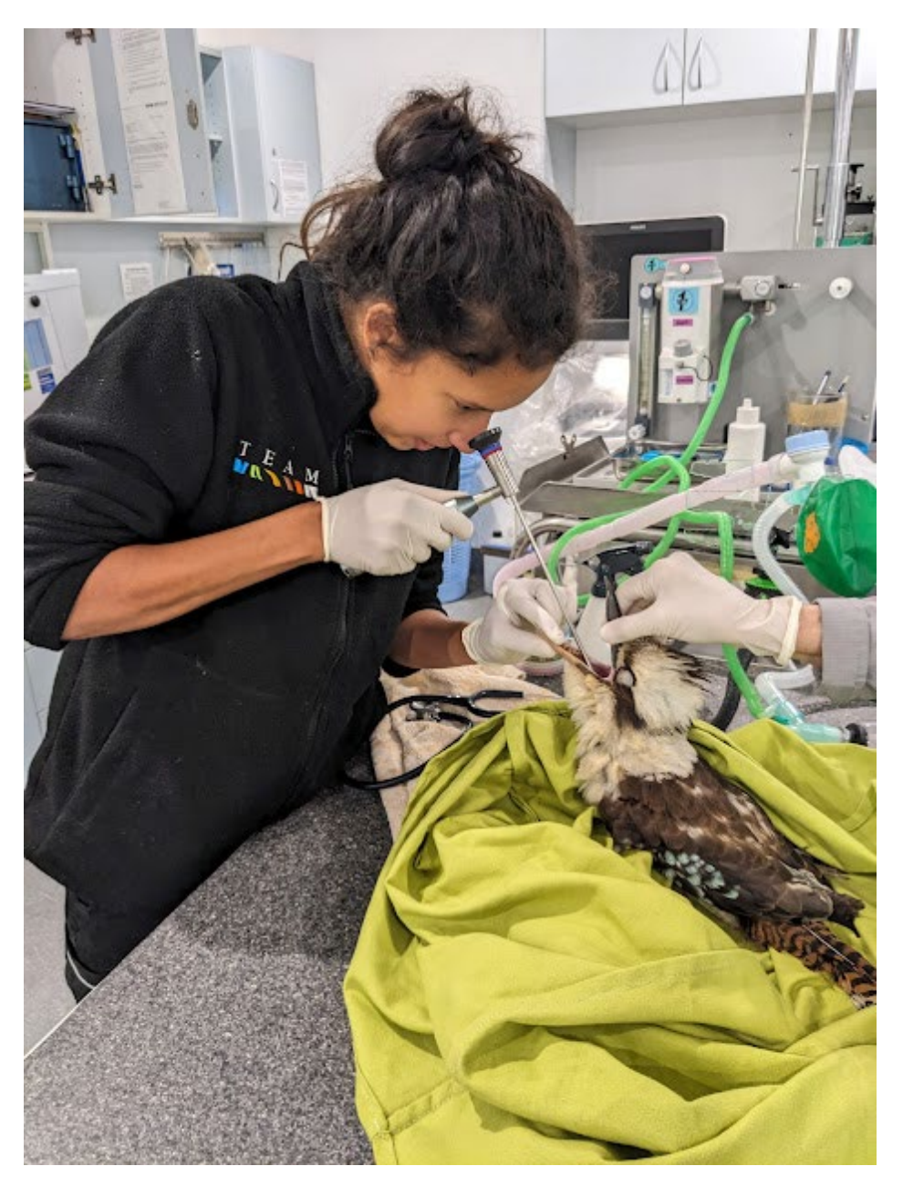
Figure 2- assessment of a kookaburra's deep oral structures

Unexpectedly, we managed to receive the endoscope below the estimated quote, with $345 left over. We were able to spent the excess amount on purchasing new clippers (with a spare blade) and a pharmacy grade scale. The clippers are used on a daily basis to enable us to shave fur from animal for venous access, allowing us to administer intravenous mediations/ fluids and perform blood collections. The scales allow us to measure very small amounts of medications accurately, so we can dispense small amounts to carer's looking after wildlife through FAWNA.