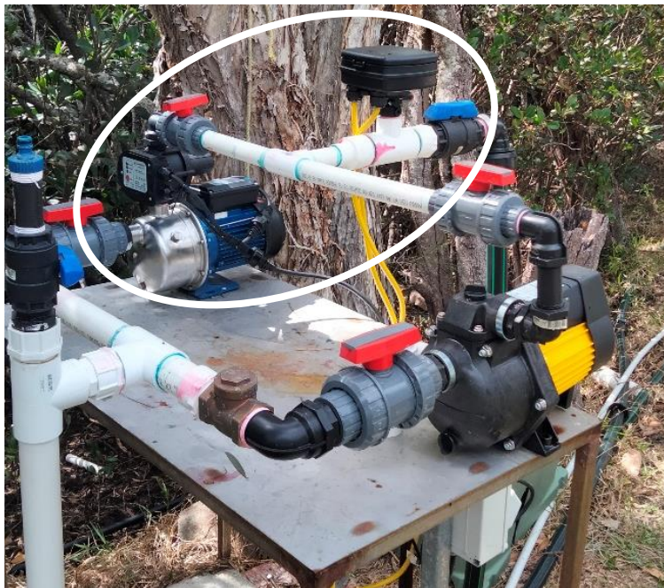
Photos showing pump station with dual pumps. The newly installed pump, flow switch and controller are circled.