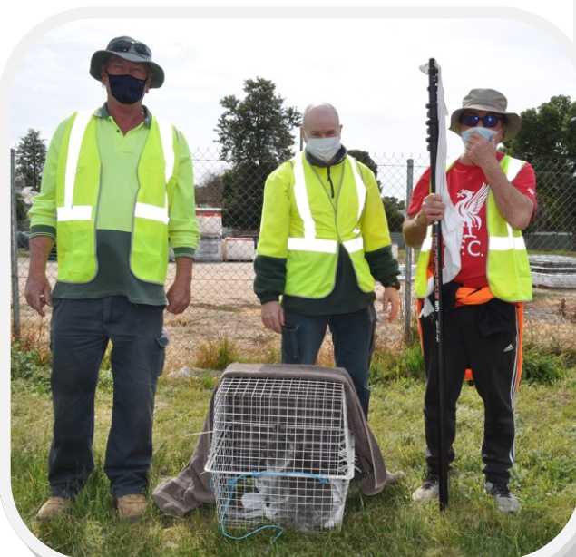
L—PPE and extension poles greatly enhance safety and ease of rescues for willing helpers.