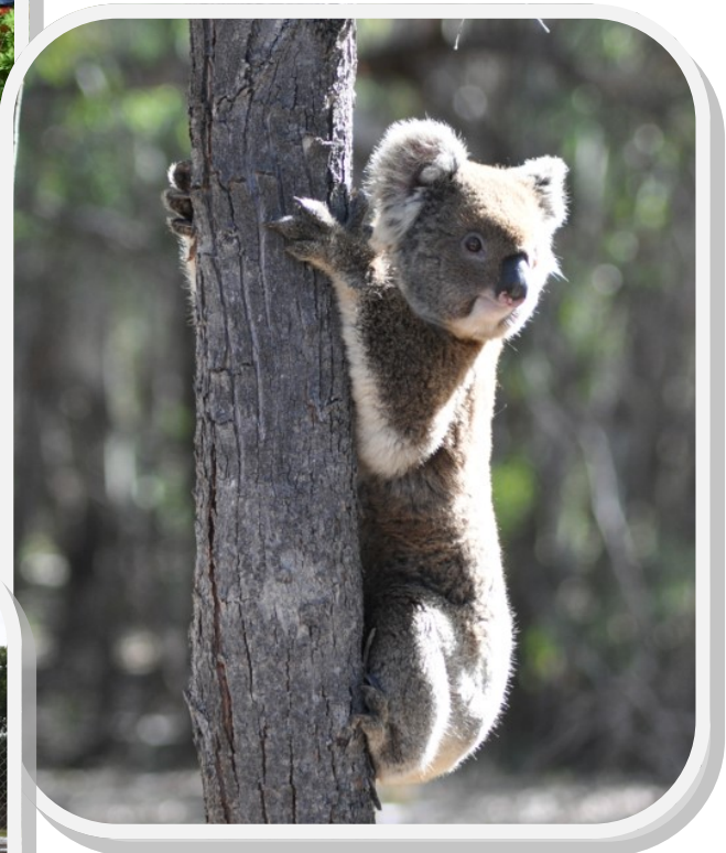
R—You really truly want me to come down?