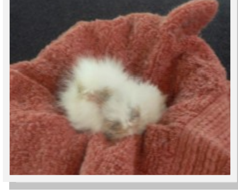
The flying-fox pups pictured left were the first wildlife patients in the NWC brooder. Sadly at time of reporting the equipment is unserviceable and we are waiting for fan repairs to be completed.