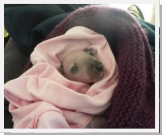
Marsupials, including severely dehydrated joeys like the one below all benefit from a stable environment

The Brinsea TLC40 brooder/intensive care unit is simple to use and humidity and temperature levels are easily visible as well as being able to observe the animal inside without disturbing it.