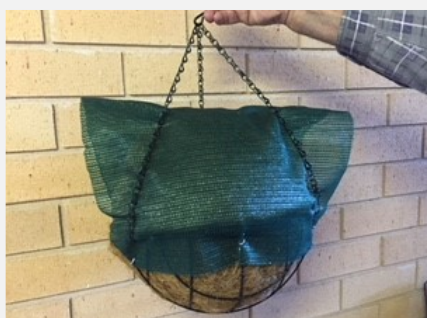
A new home to go with Ringtail Possums on their release back to the wild.