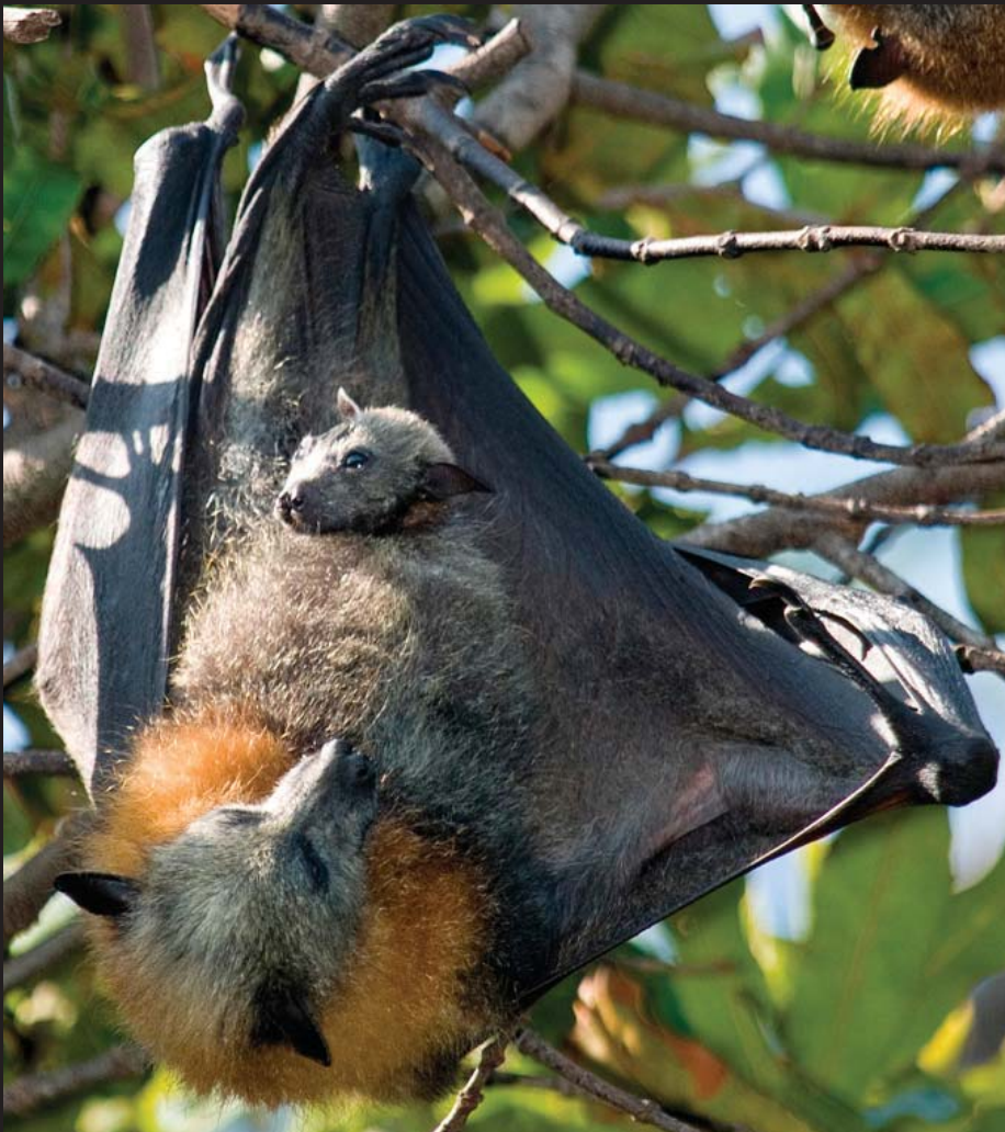
Left: This photo was taken a short while later of the same flying-fox with her new baby.