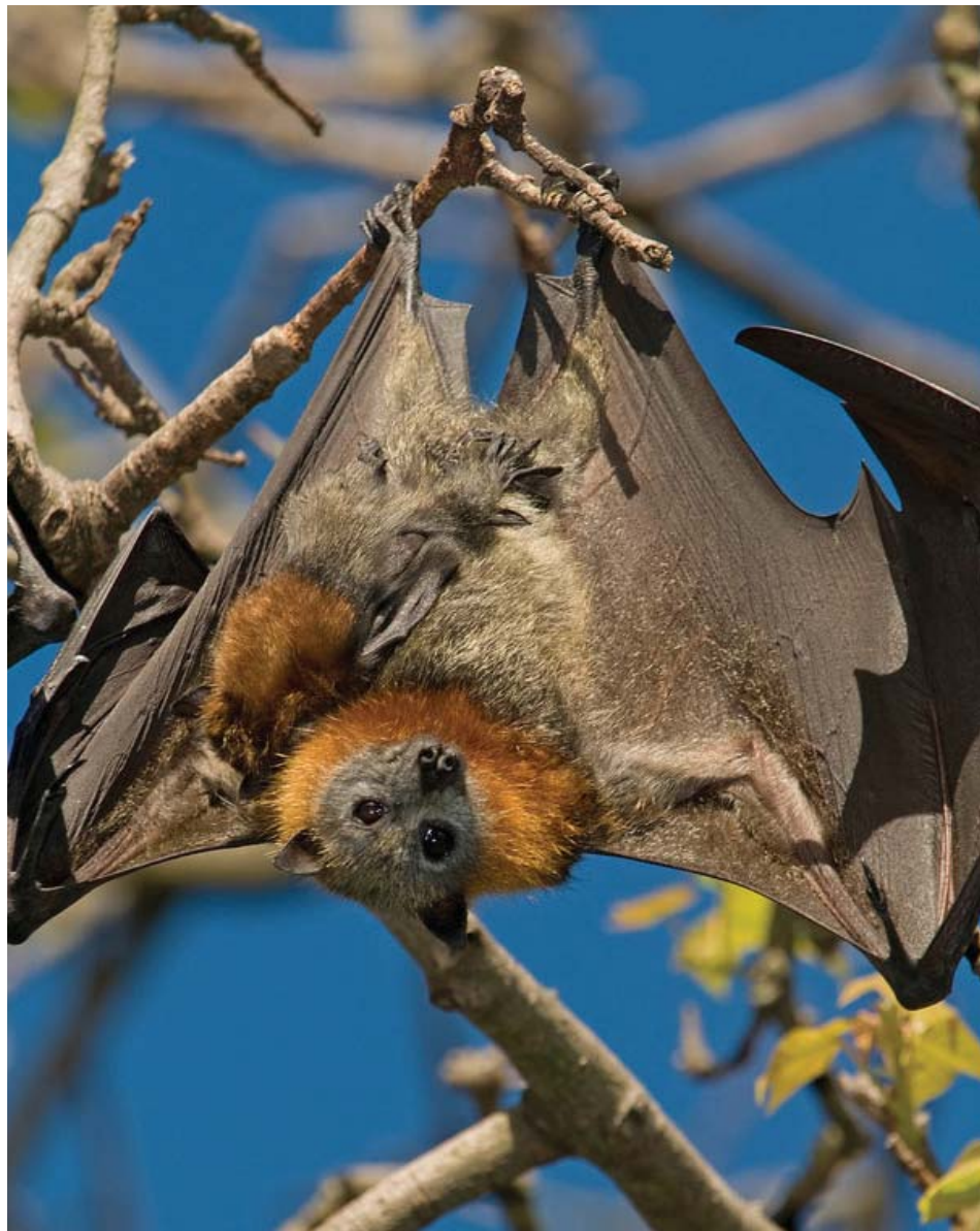
Female grey-headed flying-fox stretches in the sun as her young pup takes milk from the nipple under her wing.

The term camp (or colony ) is generally used to refer to a site where flying-foxes roost, rather than to a group of a particular number of flying-foxes, eg the flying-foxes have a 'permanent' camp at Ku-ring-gai in North Sydney,