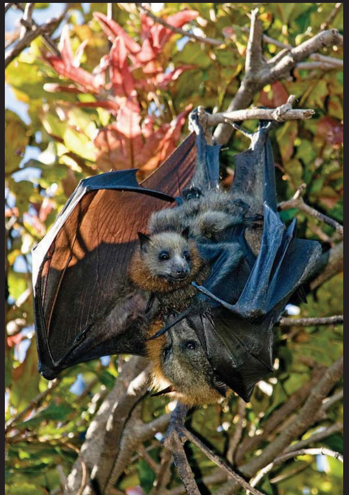
Although still dependant on its' mother for nutrition, this young grey-headed flying-fox is starting to take a lot of interest in its' surroundings.