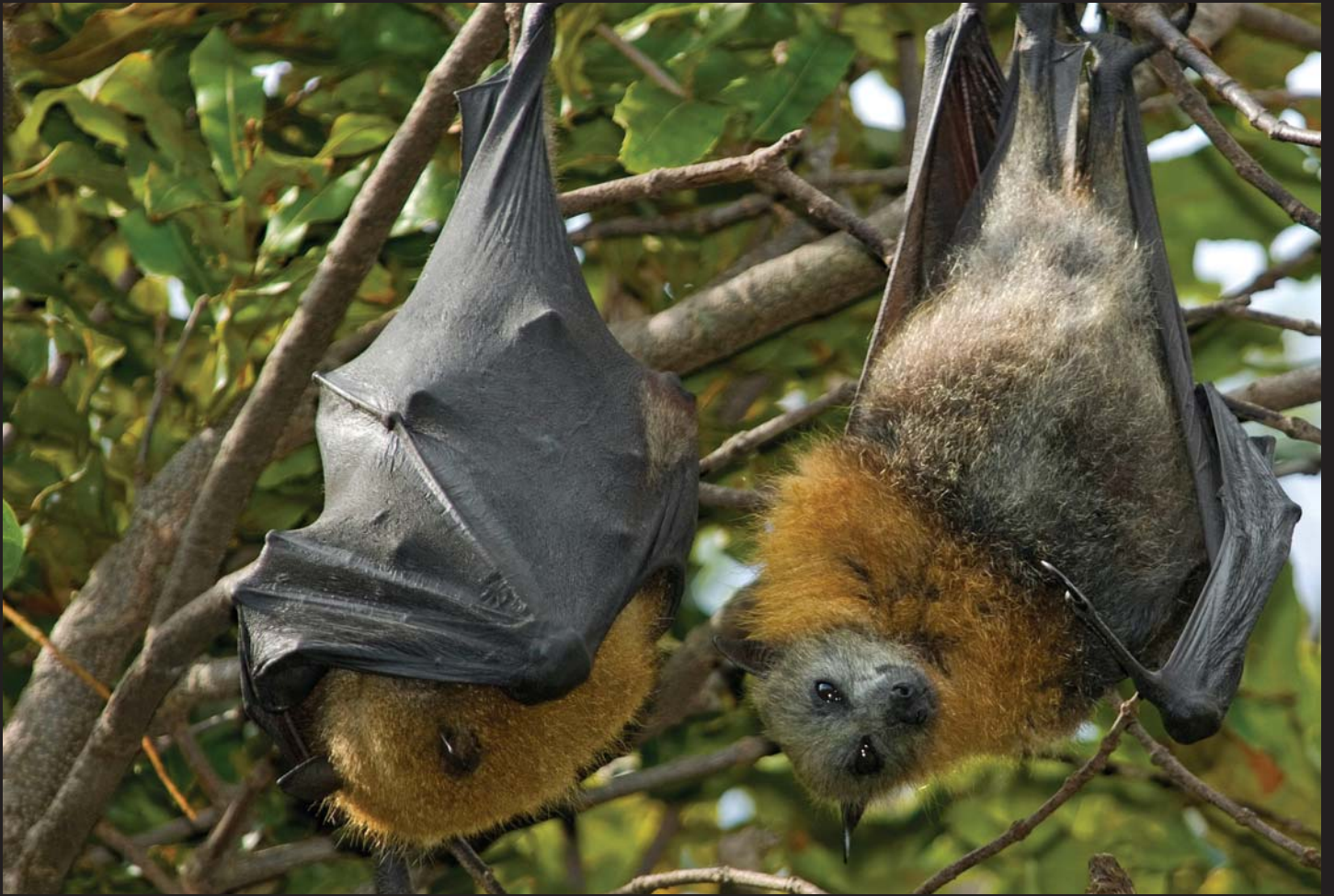
Above: A heavily pregnant grey-headed flying-fox and sleepy "friend" in one of the Sydney colonies.