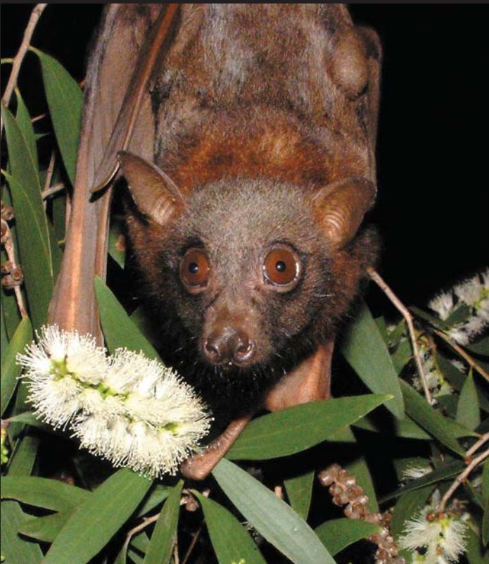
Little red flying-fox.