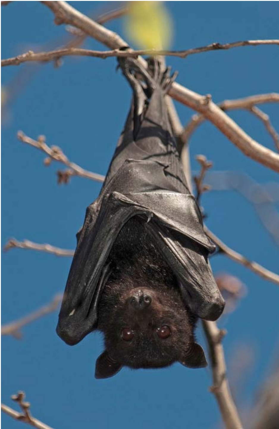
A young black flying-fox ( Pteropus alecto ) roosting in a Sydney colony which is the far southern end of their range.

disperse up to 60,000 seeds in one night.