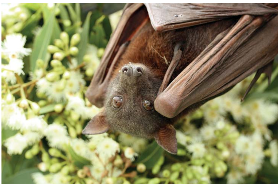
Little red flying-fox.

By dispersing rainforest seeds over wide areas and across cleared ground, flying-foxes give seeds a chance to grow away from the parent plant, and potentially expand remnant patches of valuable rainforest vegetation. It is estimated that a single flying-fox can