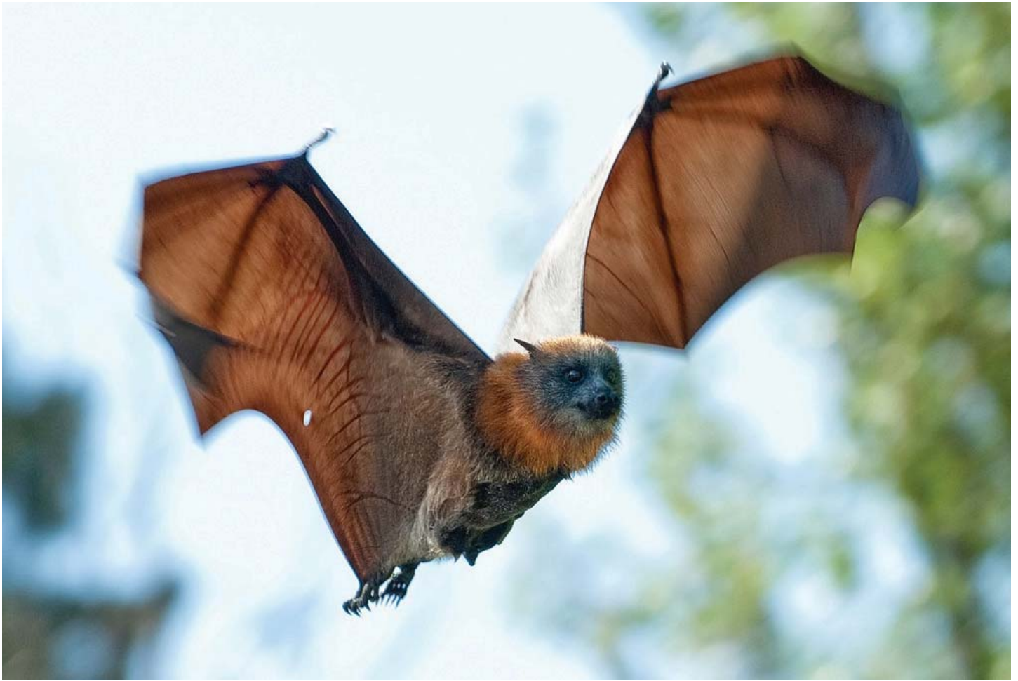
The wet belly of this grey-headed flying-fox means that she's just "belly dipped" in a nearby stream to cool and rehydrate herself.