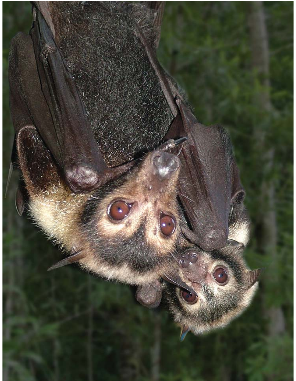
Spectacled flying-fox and baby.

With the increasing tendency for flying-foxes to find reliable food and water near people, there is increasing pressure from humans who sadly do not want to share their lives with flying-foxes. Camps can be noisy (particularly when the bats are mating or disturbed) and do have a distinctive smell that is not to everyone's taste. For this reason, many people object to camps being set up near their homes. Other people don't like flying-foxes because of the mess they make when feeding, or simply because they have been taught through folklore, media propaganda and rumours that flying-foxes are scary, diseased, ugly animals. If only they knew