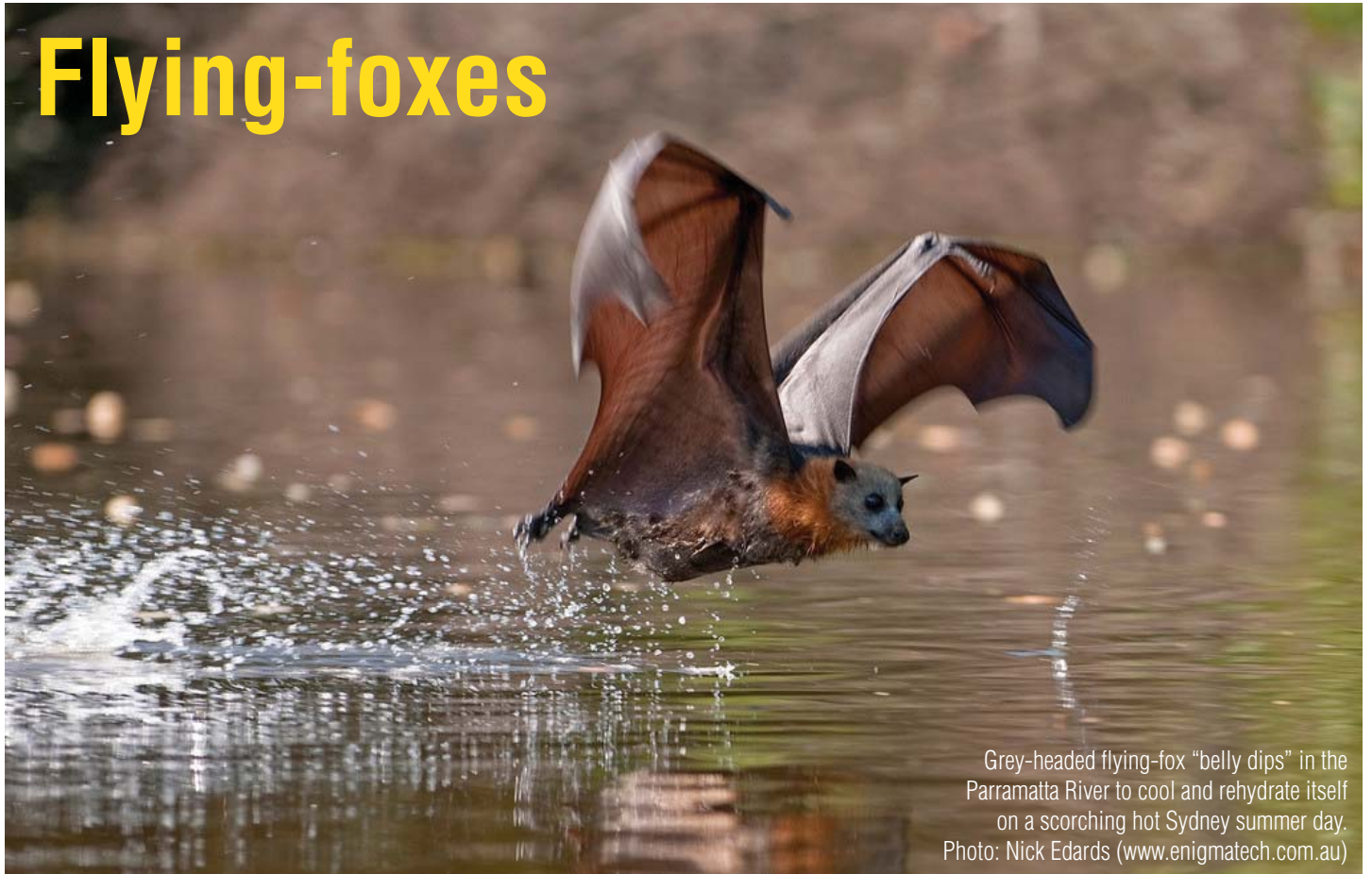
Grey-headed flying-fox “belly dips” in the Parramatta River to cool and rehydrate itself on a scorching hot Sydney summer day.