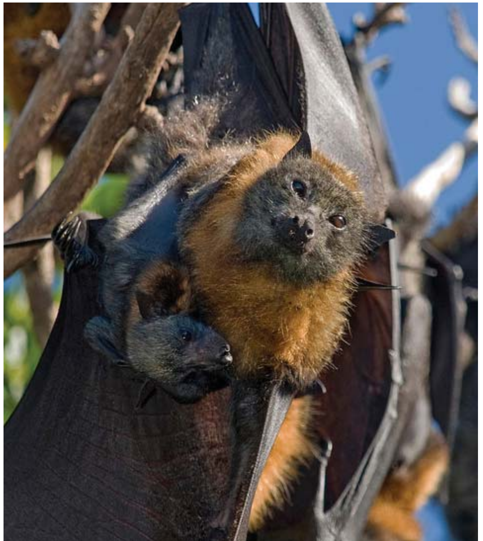
This female grey-headed flying-fox is tending her young pup which appears to be at most a week or so old.

Most people do not realise just how essential flying-foxes are to the health of our native forests. Flying-foxes have adapted to an unreliable food resource by being nomadic. When a species of tree flowers well in a particular part of their range, tens of thousands of flying-foxes will congregate to feed on the blossom. Radio tracking of individual flying-foxes, combined with observations of population fluctuations at colony sites, has confirmed that