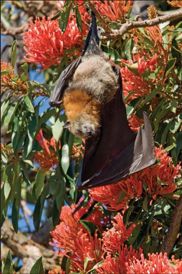
Pregnant grey-headed flying-fox enjoys the spring sun in a Sydney flying-fox camp.